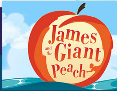
JAMES AND THE GIANT PEACH