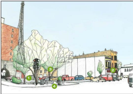
EX. 1: MARKET & MAIN (CURRENT)

This is listed as a Tier 3 priority because it will be more successful as revitalization of Downtown matures. This will result in a need to offer fewer financial incentives because the private sector will be able to obtain a reasonable return on its investment without public assistance.