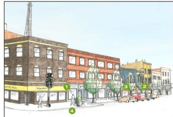
EX. 2: MARKET & MAIN (REDEVELOPED)