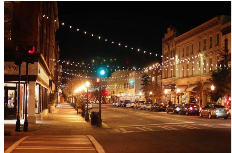
EX. 5: DECORATIVE LIGHTING