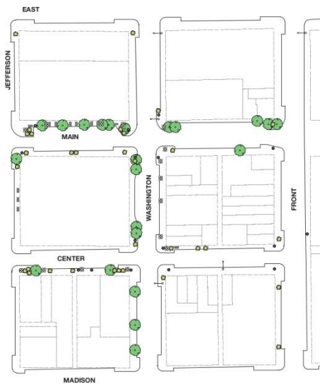
EX. 1A: CURRENT STREETScape