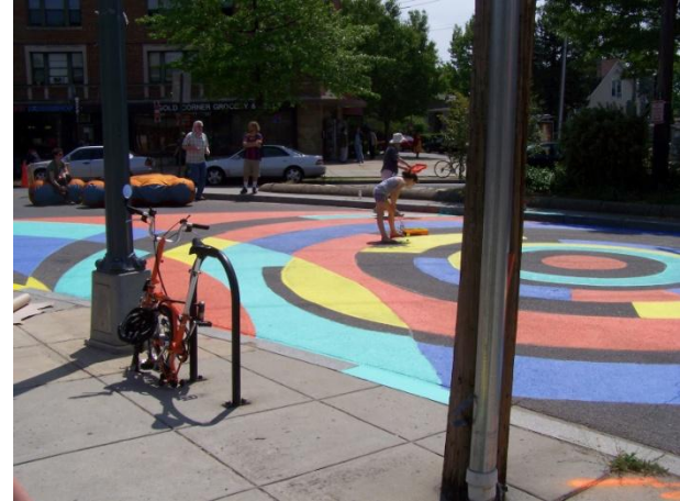
EX. 4: STREET ART