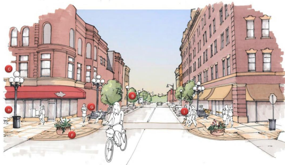
Figure 3.2c – Conceptual view looking west on Jefferson Street at Center Street. Letters correspond to amenities highlighted on Page 13.