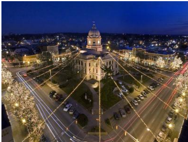
EX. 3: DECORATIVE LIGHTING