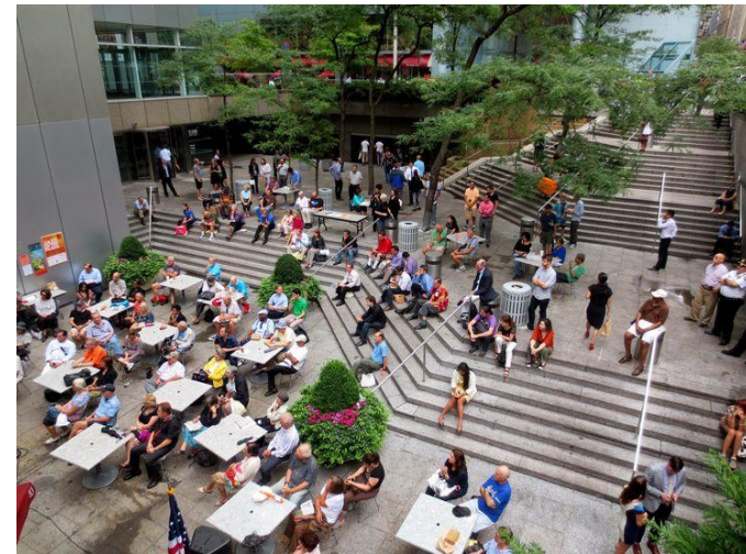
EX. 2: PUBLIC PLAZA