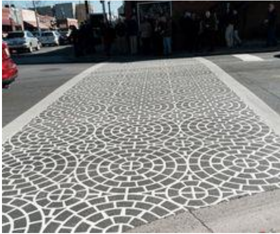
EX. 2: DECORATIVE PAINTED CROSSWALK