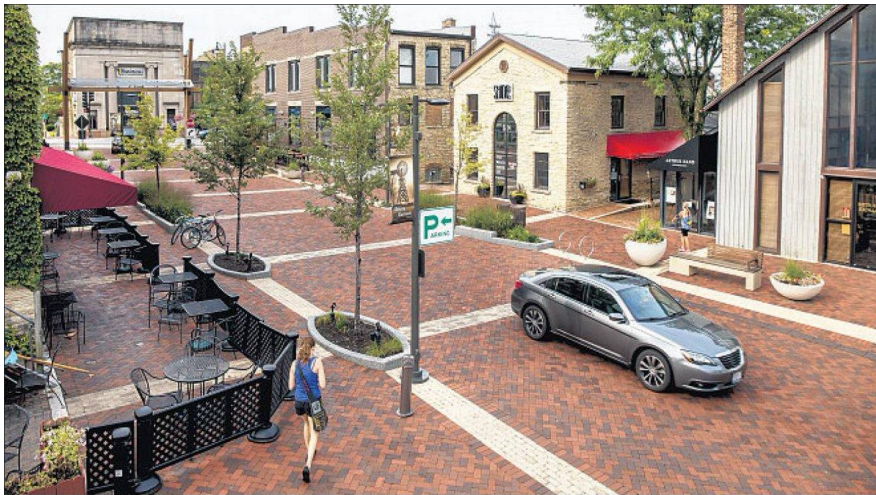
EX. 1: SHARED ROAD MODEL