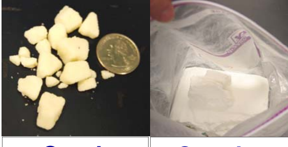
Crack (Rock, Freebase)