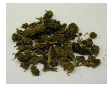
Marijuana (Pot, Weed, Blunts, Grass, Reefer, Ganja, Chronic)